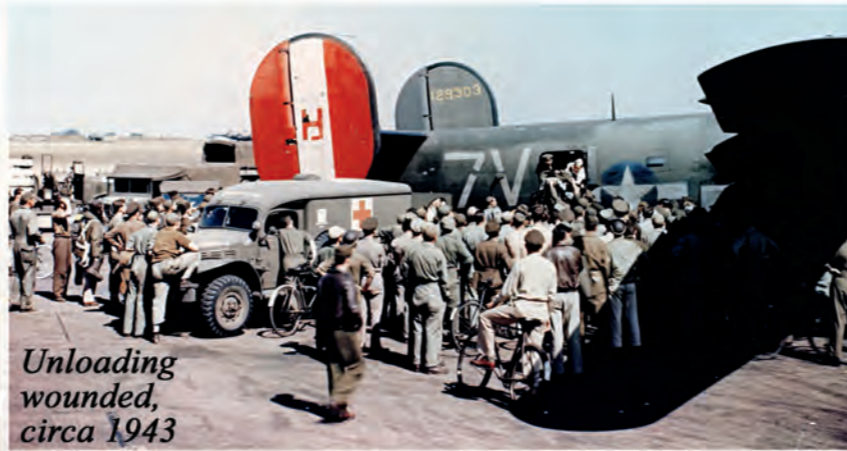
Unloading wounded, circa 1943