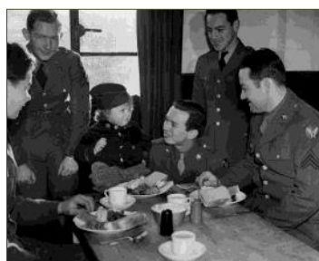
An orphan from London visits the 306th Bomb Group at Thurleigh where she christened a B-17 Flying Fortress, the "Sweet Pea."

American Eighth Air Force veterans and British children and young adults who remem-