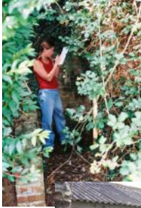
Part of a university survey team at Ridgewell in 2002.