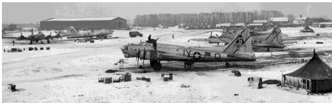
Conditions for ground maintenance crews in wartime England proved to be arduous at best. Cold and wet winter weather with aircraft parked on hardstands often placed hard-pressed ground crews in exposed positions as they labored to repair bombers and make them ready for the next mission. 401st Bomb Group (H), Deenethorpe flight line, circa winter 1944. National Archives.

"Donations and support from many patrons over these years have made it possible to produce this enormous library of oral history interviews across the globe. Now I hope many who are interested in the history of the Eighth Air Force will support the next phase of transcription and writing that will bring new and important books on the military and social history of the air war in the E.T.O." (see details on how you can help on page 8).