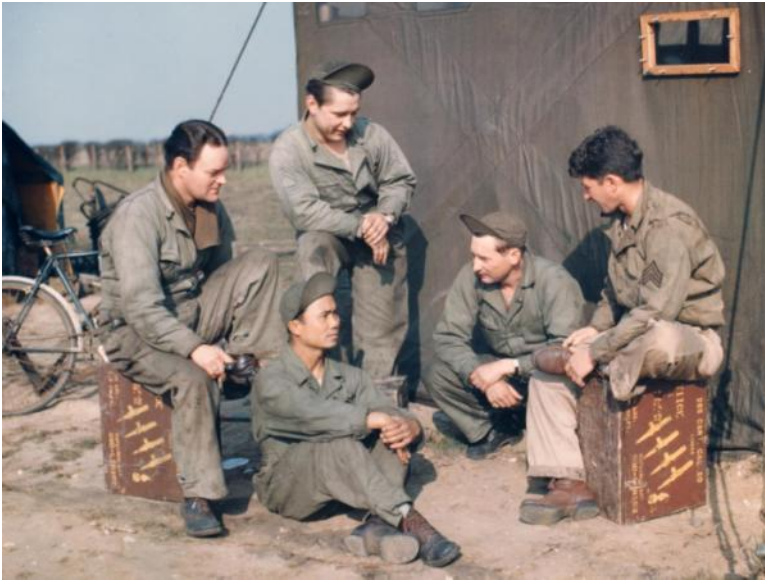
Sweating out the return of aircraft from a mission.