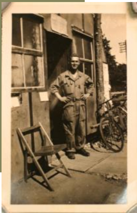
East Anglia Air War