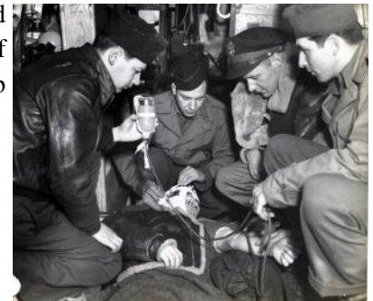
Medics and surgeons stabilize a gunner aboard a fortress.